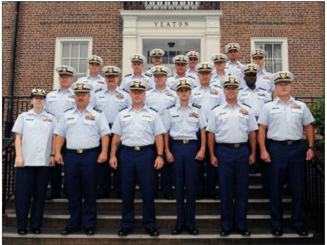
Members of CWOPD Class 09-10

We were busy, there is no doubt about it, but every task assigned us was for our professional benefit and we learned a great deal during our time in New London. Now please don't get me wrong, our time in Connecticut was