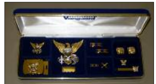
CWO Gift Set

CWO2 GIFT SET: USCG Officer Hat Devices, Tie Bar, Tie Tack, Belt Buckle and Cuff Links plus CWO2 Collar Devices for shirts and jacket/raincoat in handsome felt-lined case. $56.00.