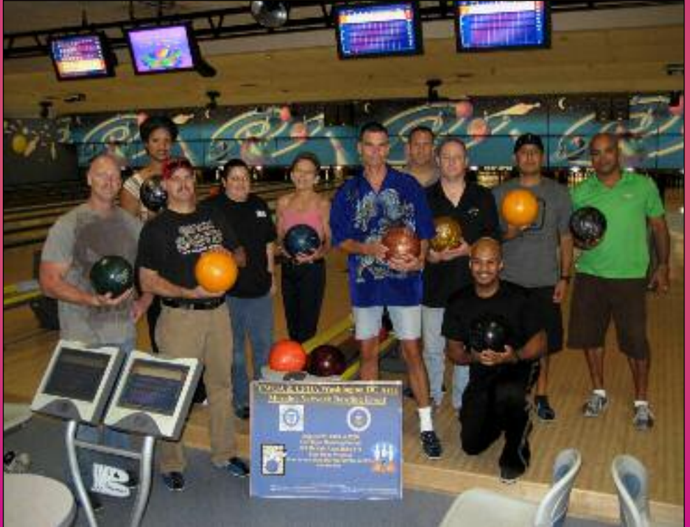
Some of the keglers who participated in the Aug. 25th CWOA-CPOA event.

On Aug. 25th, 15 Washington DC Chapter, CWOA members and two local CPOA members held a Morale/Networking Bowling Event at the Fort Myer Bowling Center. It was a fun time for all and a few high games were thrown before everyone switched to bowling opposite-handed. Thanks to both groups for funding the event and hopefully there will be several more Morale/Networking events in the future.