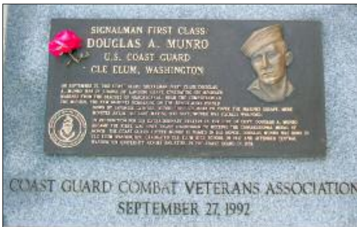
A rose placed on the gravestone of Douglas A. Munro during the Sept. 27th Memorial Service in Cle Elum, WA.