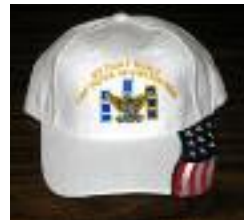
(Left) White Ballcap

CWO2 GIFT SET: USCG Officer Hat Devices, Tie Bar, Tie Tack, Belt Buckle and Cuff Links plus CWO2 Collar Devices for shirts and jacket/raincoat in handsome felt-lined case. $56.00.