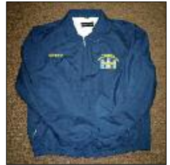
Medium weight Jacket

MEDIUM WEIGHT LINED JACKET: Dunbrooke brand Navy Blue with embroidered CWOA Marketing Logo on left chest. Personalized embroidered name or message available on right chest at no extra cost if requested at time of order. $55.00 for sizes S, M, L or XL plus $6.50 shipping & handling. Add $2.00 for size XXL.