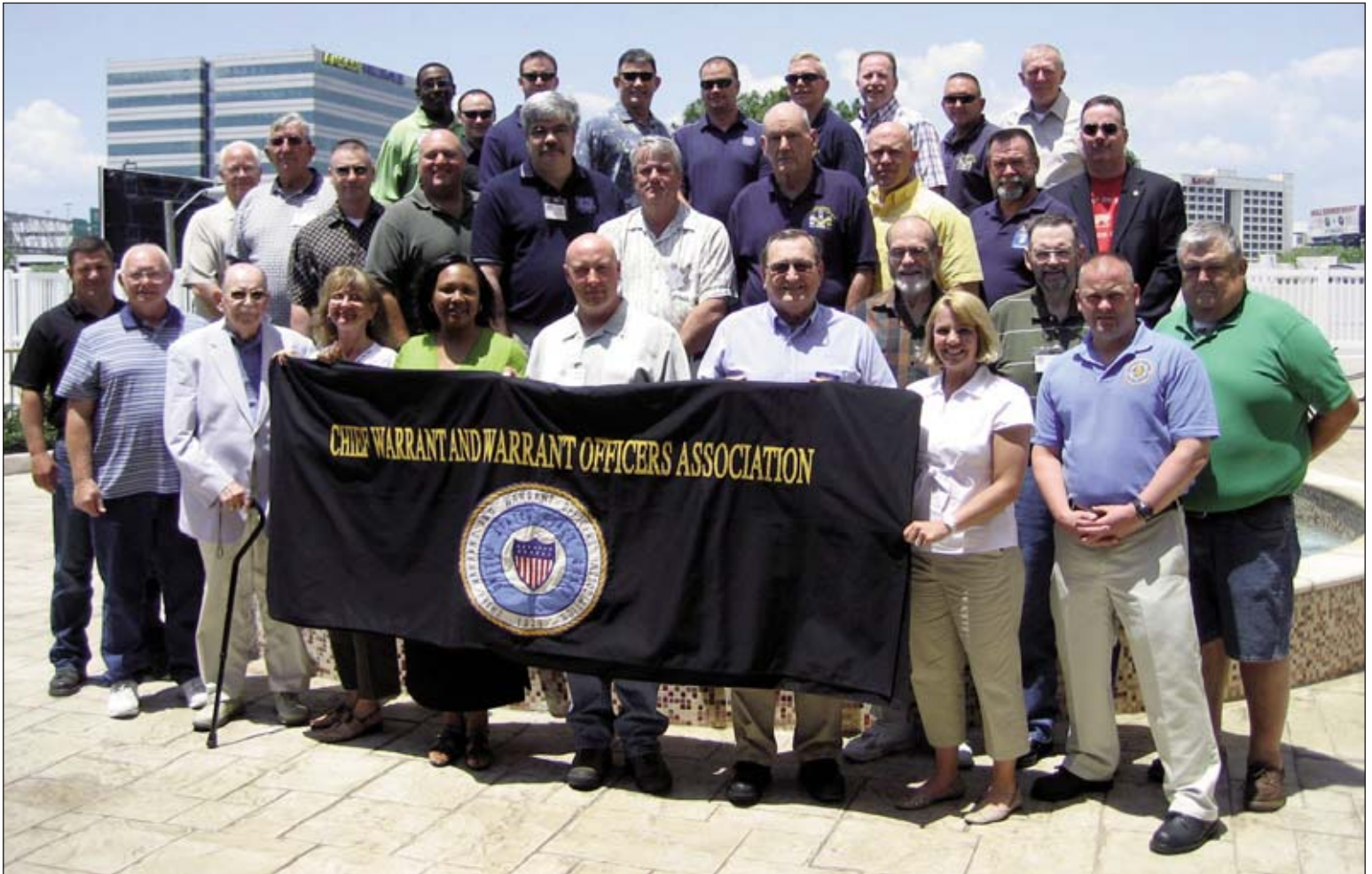
Officers and Chapter Representatives at the CWOA Annual Meeting in Tampa, Florida in April.

New Officers Sworn In and Two New Distinguished Members Selected in Tampa