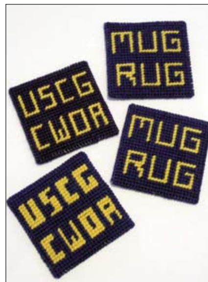
Reversible coffee mug coasters made by Suncoast Chapter and provided to all the chapter representatives.