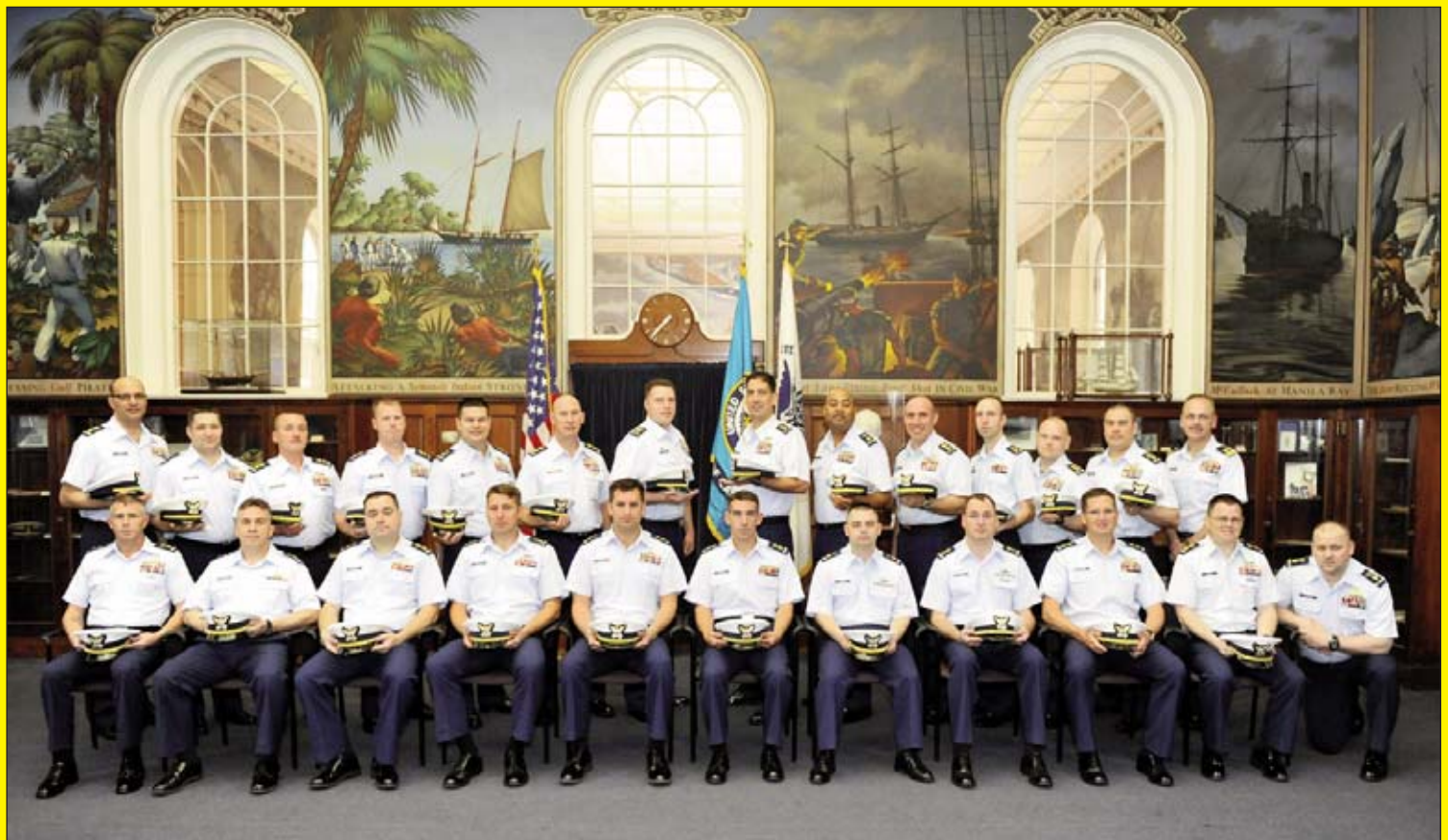
Members of CWOPD Class 05-09

Chief Warrant Officer Professional Development (CWOPD) Class 05-09 arrived in New London, Connecticut seeking the tools and training to assist with our transformation. Beginning on the first day, the CWOPD staff began to not only set expectations, but also provide us with many “tools for our toolbox.” While Military Etiquette and Sword Manual are certainly part of the curriculum, we took away many other valuable lessons in addition to the oft-maligned “Knife and Fork” portion of the course. We sharpened our writing skills, and had the opportunity to improve public speaking. The staff