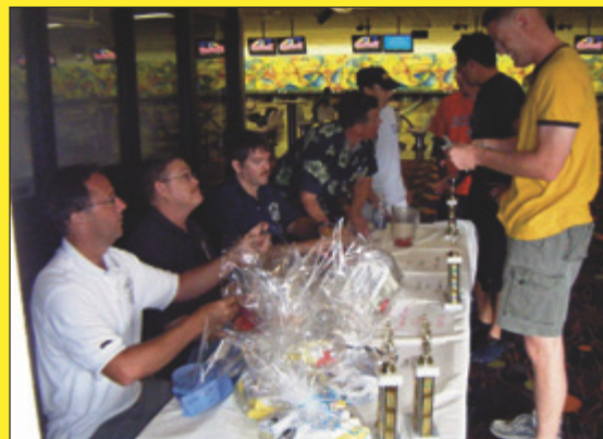
Tournament contestants register April 11th at the SparZ bowling alley in Davie, FL