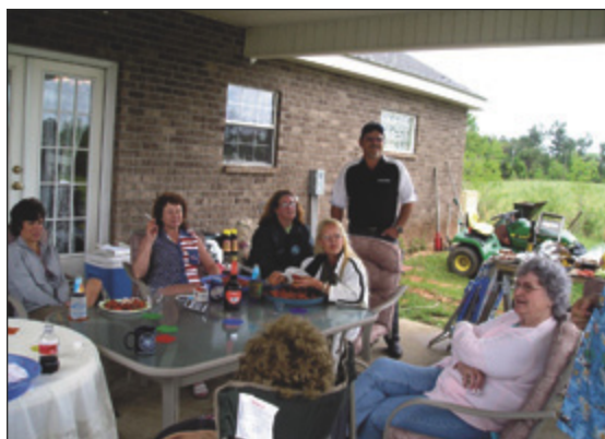
Lots of camaraderie at the New Orleans Chapter BBQ on April 5th.

This contract started in late 2002. I'm a retired CWO