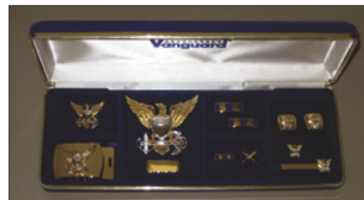
CWO Gift Set

(Right) Design used on Lapel Pin, Embroidered Patch and Decal