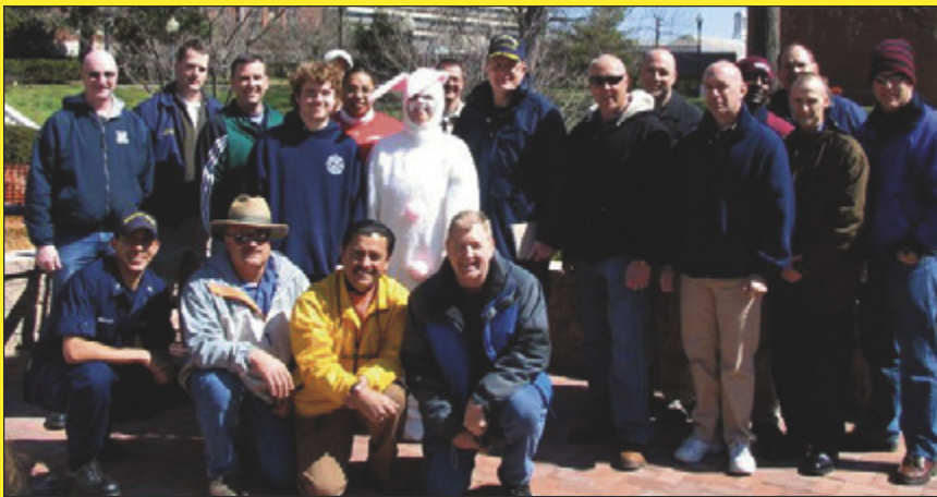
Participants in the 2008 CWOA Childrens Easter Party and Egg Hunt at Walter Reed Army Medical Center.