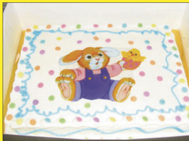
The Easter Cake.