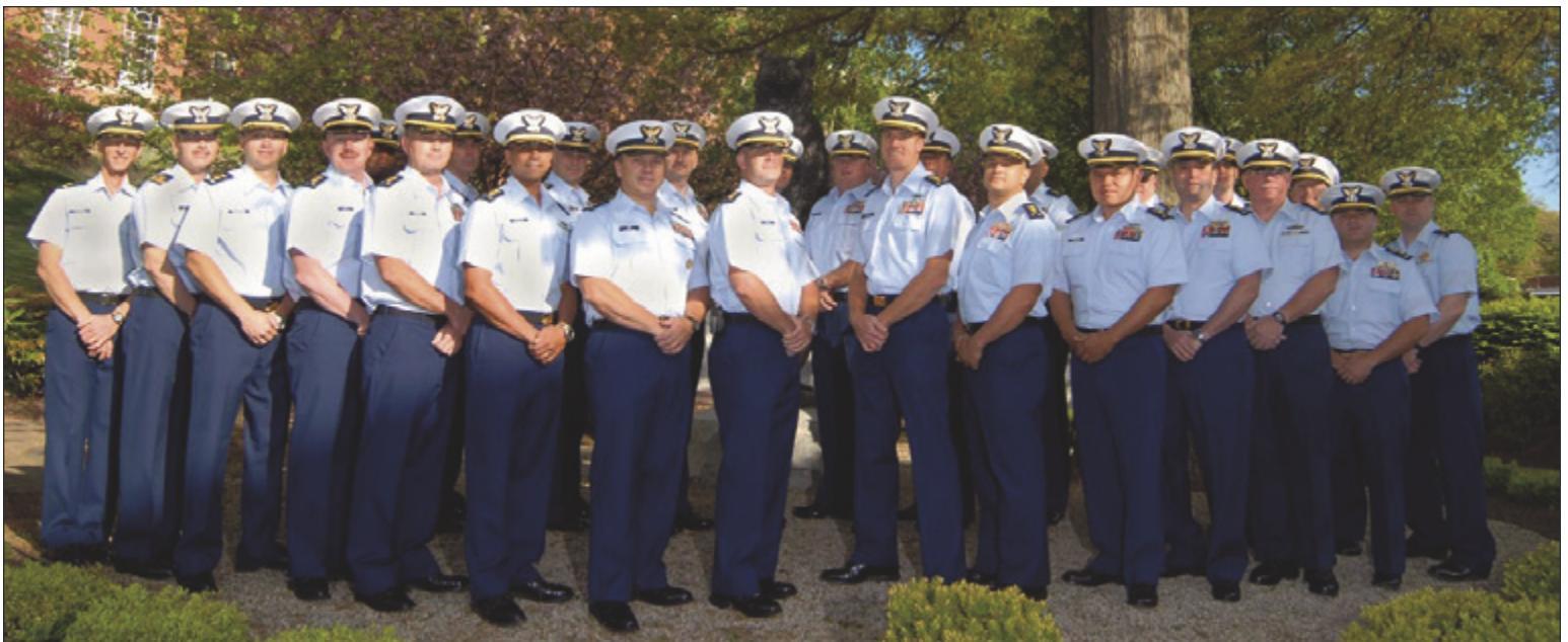
Members of CWOPD Class 06-08