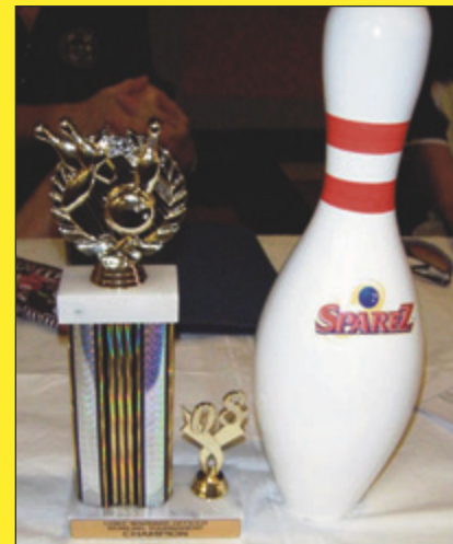
Some of the bowling tournament trophies.