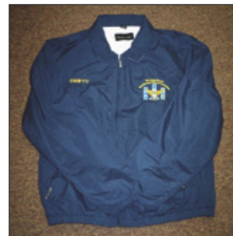
Medium weight Jacket

MEDIUM WEIGHT LINED JACKET: Dunbrooke brand Navy Blue with embroidered CWOA Marketing Logo on left chest. Personalized embroidered name or message available on right chest at no extra cost if requested at time of order. $48.00 for sizes S, M, L or XL plus $6.50 shipping & handling. Add $2.00 for size XXL.