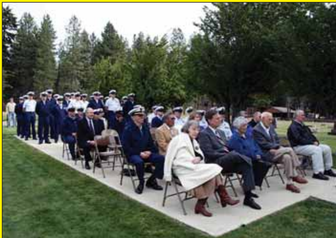
(Above) Some of the more than 150 people who attended the graveside ceremony honoring Douglas A. Munro on 27 September in Cle Elum, Washington.