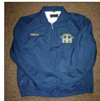
Medium weight Jacket

MEDIUM WEIGHT LINED JACKET: Dunbrooke brand Navy Blue with embroidered CWOA Marketing Logo on left chest. Personalized embroidered name or message available on right chest at no extra cost if requested at time of order. $48.00 for sizes S, M, L or XL plus $6.50 shipping & handling. Add $2.00 for size XXL.