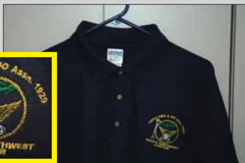
The PNW Polo Shirt and logo (inset)