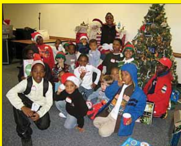
(Right) Eighteen children from the Wash., D.C. Southwest Community with Santa Claus.

depends on how close they are to full retirement age once they begin to take those benefits. Retirees who file for Social Security at age 62 and live into their mid-90s could lose nearly $150,000 in benefits. Those who wait till after age 66 will enjoy an 8% annual increase in benefits until age 70. (After that, there's no advantage to delaying benefits.) Yet on the most fateful financial decision most of them will make, only about 5% of retirees wait until after they've reached full retirement age to claim benefits.