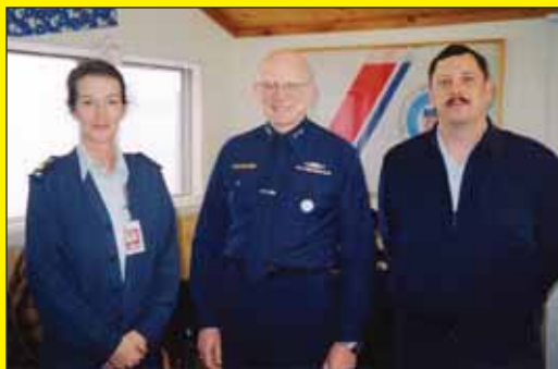
(Left) Just a portion of the extensive "chow line" that easily fed nearly 100 hungry guests at the Holiday Reception.