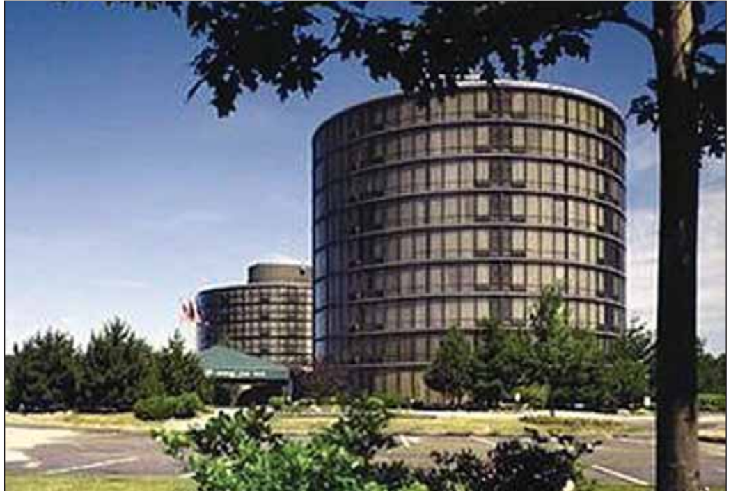
The twin towers of the Wyndham Hotel Portland Airport are just a short walk or drive from the huge Maine Mall and numerous restaurants in Portland.

The good folks at Rocky Coast Chapter, who are spon-