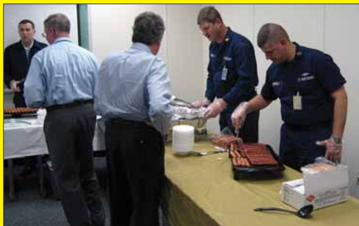
It was a continuous line of customers for more than an hour at the DC Chapter hot dog sale at CGHQ

On November 29th, Washington DC Chapter sponsored a hot dog sale at both the CG Headquarters and nearby Jemal Buildings, feeding more than 300 hungry Coast Guard military and civilian personnel hot dogs, sausages and homemade chili. The event raised $625 for the chapter, which couldn't have come at a better time as chapter members had already voted to continue their tradition of supporting the PATFORSWA MWR Holiday party, provide gift cards to lower income enlisted personnel, and help out Angel Tree kids as identified through the Salvation Army. Nice going gang!