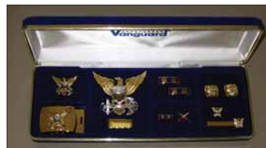
CWO Gift Set

(Right) Design used on Lapel Pin, Embroidered Patch and Decal